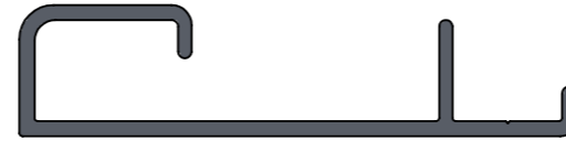
EXTRUSION PROFILE SCALE 1:1