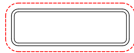
--- EXPOSED SURFACES SCALE 1:1