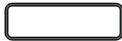
EXTRUSION PROFILE SCALE 1:1